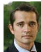
CHRISTIAN KJAER CHIEF EXECUTIVE OFFICER, EUROPEAN WIND ENERGY ASSOCIATION

In the US in 2006, wind power was second only to gas in terms of new capacity, and the same was true for the seventh year running in the EU, where new wind power installations in 2006 amounted to 7,588 MW, while gas stood at approximately 8,500 MW of electricity-generating capacity. Between 2001 and 2005, 30 per cent of all new capacity installed in the EU was wind power. In that same period, 53 per cent of all new installed electricity-generating capacity in the EU was gas.